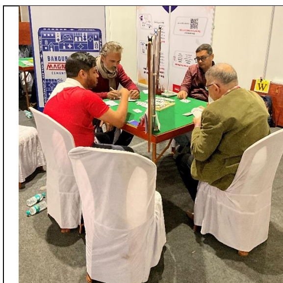
RUIA SILVER Final, Avengers Assemble vs. Adventurers